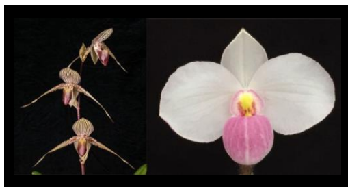
HP909 Paph. Delrosi ( delenatii '4' x rothschildianum 'Electra' HCC/AOS) Remake of a popular rothschildianum hybrid with 67 AOS awards. This remake utilizes a recently awarded Paph. rothschildianum . $ 250.00 – Flask