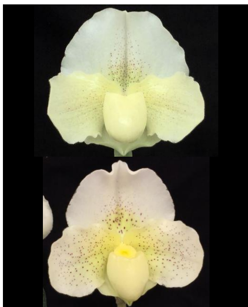
Paph. White Knight 'Clear Light' B/CSA, HCC/AOS Paph. White Knight 'Clear Light' HCC/AOS is an important parent yielding viable seed and is a fine show plant. Two previous growth and two new growths, one in bud. $ 500.00 – Whole Plant – 5" pot