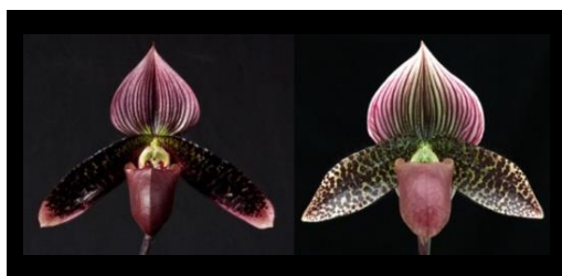
HP645 Paph. Macabre 'Black Silk' HCC/AOS x Paph. Delightfully Wood 'Dark Web' Looking for dark spotting on wide petals from this new grex. The Paph. Macabre is from our remake which received an Award of Quality. $ 125.00 – Compot

Hillsview Gardens is offering the following Community Pots. They are in limited supply and offered on a first come basis. All flasks are potted out. We should have flasks available again sometime in 2024. Thank you from us here at Hillsview Gardens for your continued support.