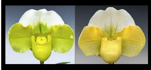
HP978 Paph. Double Up ('Walter Marx' x 'Wide Petals') An F2 sibling cross for large green to yellow flowers. These are chunky big green complex flowers. $ 250.00 – Flask – Ready August 18 th , 2024