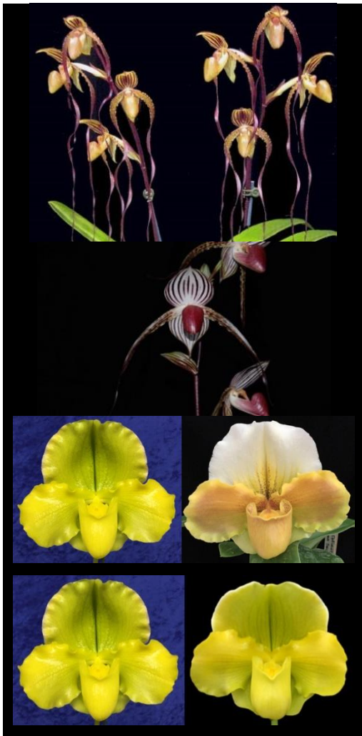
HP688 Paph. Angle Hair (Saint Swithin 'Dark Challenger' x sanderianum 'Select') Our continued foray into multiflorals simply to offer our customers some variety. $ 175.00 – Compot

Hillsview Gardens is offering the following Community Pots. They are in limited supply and offered on a first come basis. All community pots have a minimum of 25 plants. Some may have more or even less but we shoot for 25 plants as we replate in the lab. These represent full flasks potted to community pot.